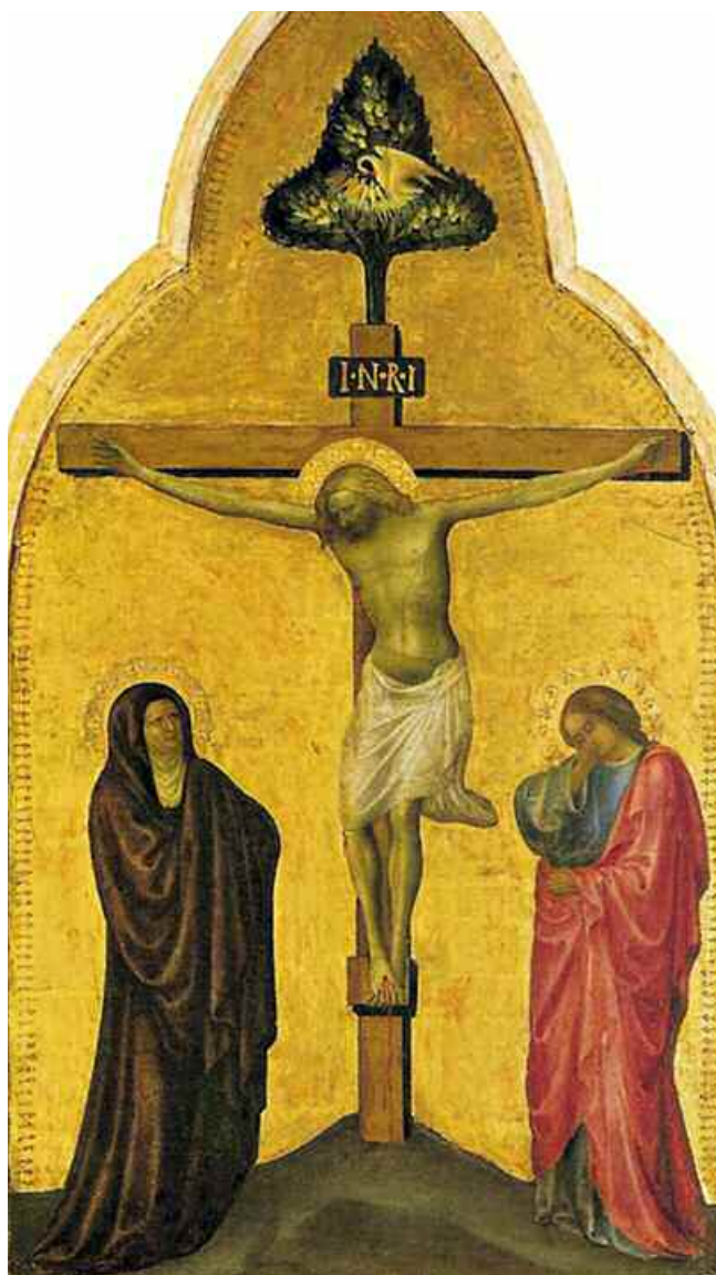
Tempera on wood panel, Masolino da Panicale (1383-1440), Vatican, Rome

Christ Jesus words from the cross: "Father, forgive them, for they know not what they do" (Luke 23:34), are more than simply a prayer that God forgive the mob for demanding His death. These words show Christ Jesus' understanding that mankind at that time had no idea of the real reason for His Crucifixion. Most men, even today, do not know this. Christ Jesus was not crucified merely that He might rise again from the dead and thus prove the fact of immortality. He was crucified, as we have seen, that the Christ might be enabled to enter the Earth to become our Indwelling Planetary Spirit, and thus continue to give of Himself year after year—century after century—until humanity at last, with the help of the sublime Christ Light, has developed its spiritual powers to the extent that it will no longer need the help of an Indwelling Planetary Spirit.