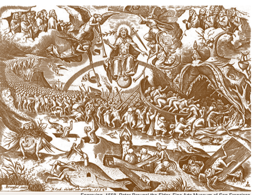
Engraving, 1558, Peter Breugel the Elder, Fine Arts Museum of San Francisco The Last Judgment

This is where the protection we spoke about before may be used. When we live lives of purity, when our days are filled with service to God and to our fellowmen, and with thoughts and actions of the highest nobility, then we create for ourselves the Golden Wedding Garment, which is a radiant force