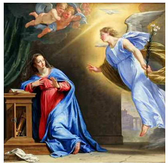
Oil on panel, ca. 1664. Philippe de Champaigne. Metropolitan Museum of Art, New York City Gabriel's Annunciation to Mary

By dint of the Jesus and Christ accomplishment, each spiritual aspirant is a primary focus of the sacred drama that is narrated by the church calen-