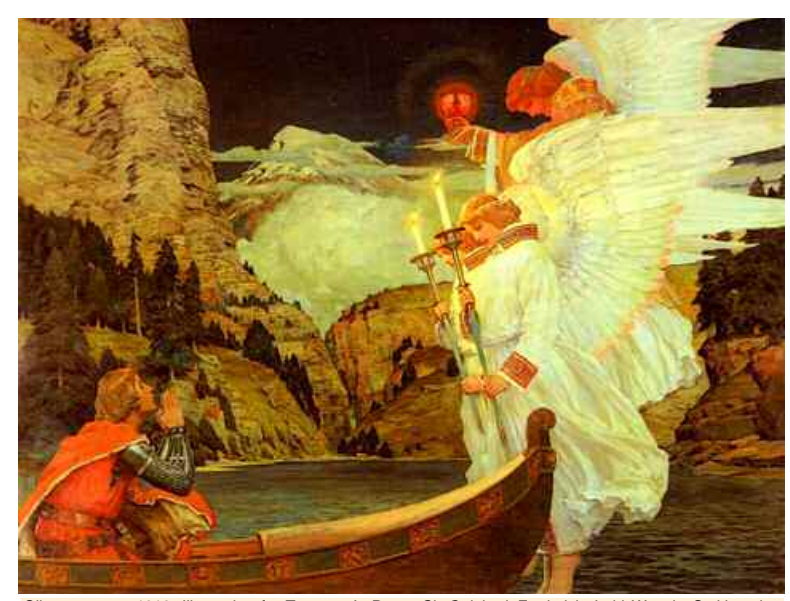
Oil on canvas, 1912, Illustration for Tennyson's Poem Sir Galahad, Frederick Judd Waugh, Smithsonian American Art Museum

As the Holy Spirit is the creative energy in Nature, the sex energy is its reflection in man. Specifically, it is the life ether of the vital body, which is the medium through which the generative function is expressed. Thus, Mary, Mother of Jesus, was, and are all mothers, overshadowed and conceive by the power of the Holy Spirit; astrologically, via Moon influences; in hierarchical terms, through the ministering energies of the angelic hosts whose highest Initiate is Jehovah and whose special