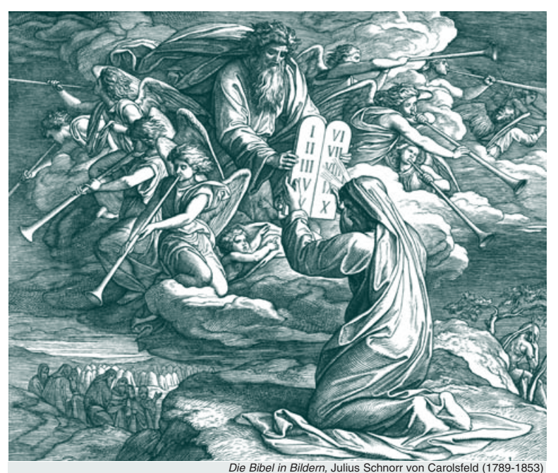
Moses Receives the Tablets of Law Saturnian Consciousness is the first phase of becoming a Teacher. The mind is ordered by law and the passional life is purified by suffering.

Each of these Compassionate Beings can create on both the spiritual and physical planes. Each is able to use the bi-polar force(masculine and feminine) through the double spinal cord, illuminated and raised in potential energy by the spinal spirit fires of Neptune (will) and Uranus (love and Imagination). This creative energy conceives in the twin hemispheres of the cerebrum, ruled by Mars and Mercury, a vehicle fit for the expression of the spirit, which is then sent out and objectified in the world by the spoken Creative Word. By means of this power he is able to perpetuate his physical existence and create a new body before he leaves the old one.