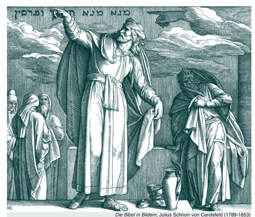
The Prophet Daniel Daniel read the divine writing on the wall. An astrologer reads stellar characters inscribed on the sphere of the heavens, as reflected in a horoscope.

No outer revelation can take the place of the inner, and as the soul draws nearer to its divine source, it seeks experience from within, knowing that true revelation is the revealing of the God