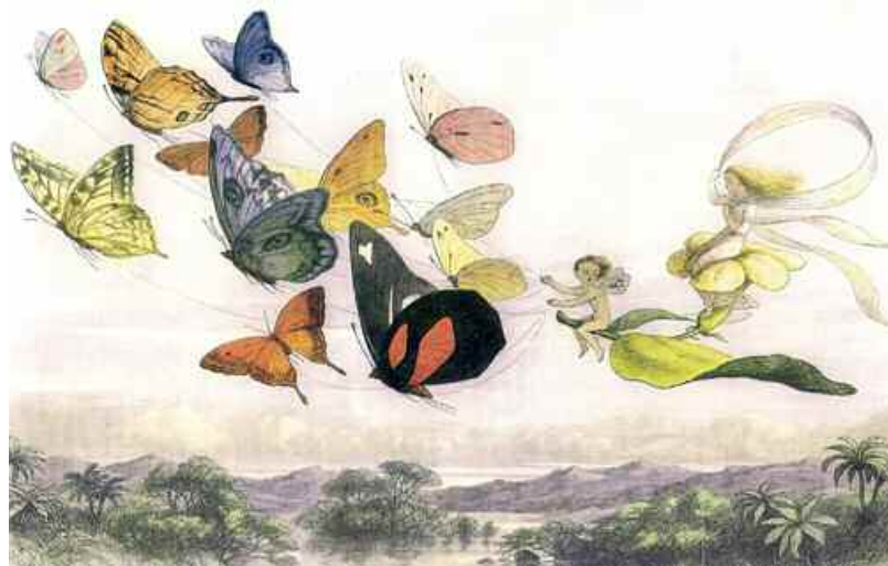
Illustration by Richard Doyle, Dover Publications, Inc.

The consciousness which builds and ensouls these elemental bodies belongs to a number of divine hierarchs who are thereby gaining additional