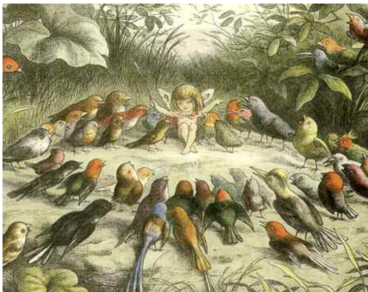
Illustration by Richard Doyle, Dover Publications, Inc.

The forces in this stratum are thus, at any time, an exact reflection of the existing moral status of mankind. From the occult point of view, the "hand of God" which smites a Sodom or a Gomorrah is not a foolish superstition, for as surely as there is individual responsibility to the Law of Consequence, which brings to each person the just results of his deeds, whether for good or evil, so is there also community and national responsibility, which brings upon groups of men corresponding results