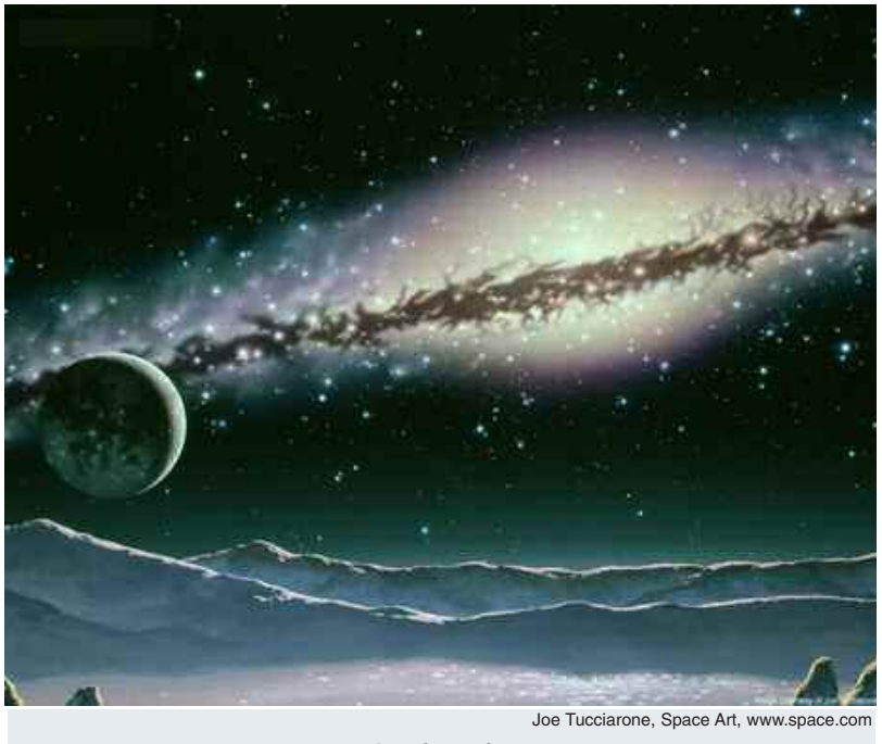
On the Edge

The oppositions with the Ascendant in some cases reveal an inner division in the individual, a state of being wherein the person endures an