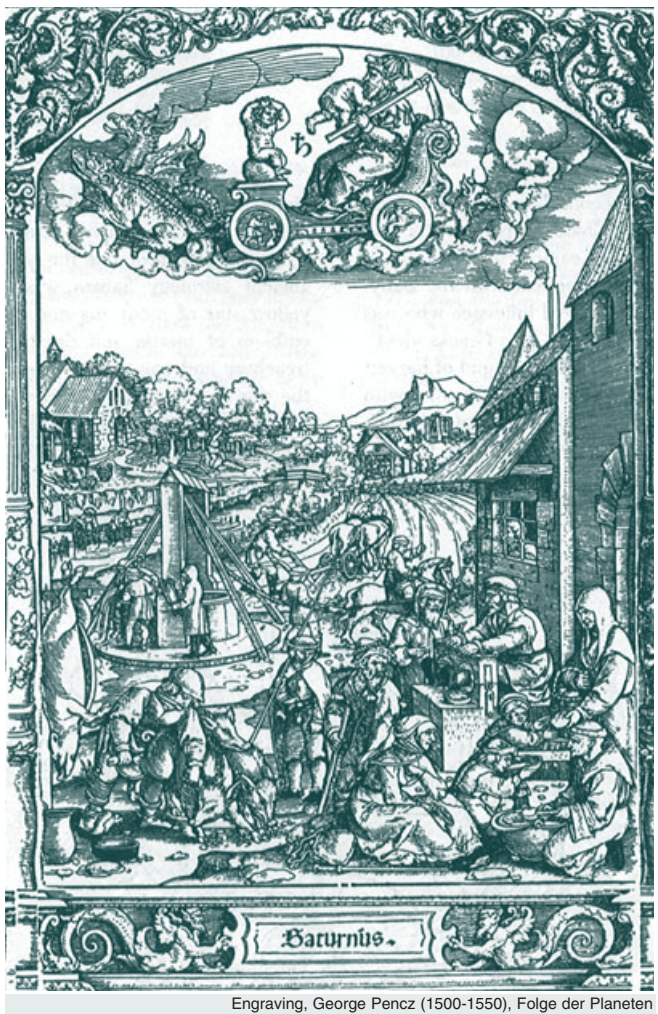
Allegoric representation of the Life of the Children of Saturn.

We find "Saturn posited in the second house afflicting the ruler of the nativity." This, we say, is a bad aspect for money. The person will never be opulent; there will be difficulty in gaining financial success, labor to acquire position in life. All this is of course true, and, measured by external reasoning alone, very unfavorable. But let us consider the matter a little closer, and see what this denial of finance means. The earnest occult student of Astrology, to whom life, with its possibilities, sorrows, joys, and opportunities, means more than worldly aggrandizement, will note that "Saturn afflicted in the house of the intellect" means a slow mind, limited mental capacity, and realizes that this very absence of means, if a punishment on the physical plane, is yet a blessing in disguise; because, considered from the higher vantage ground, this very lack of wealth, this very struggle for income, will develop intellectual capacitygrowth of mind by thought and experience-the mind thus evolving more rapidly.