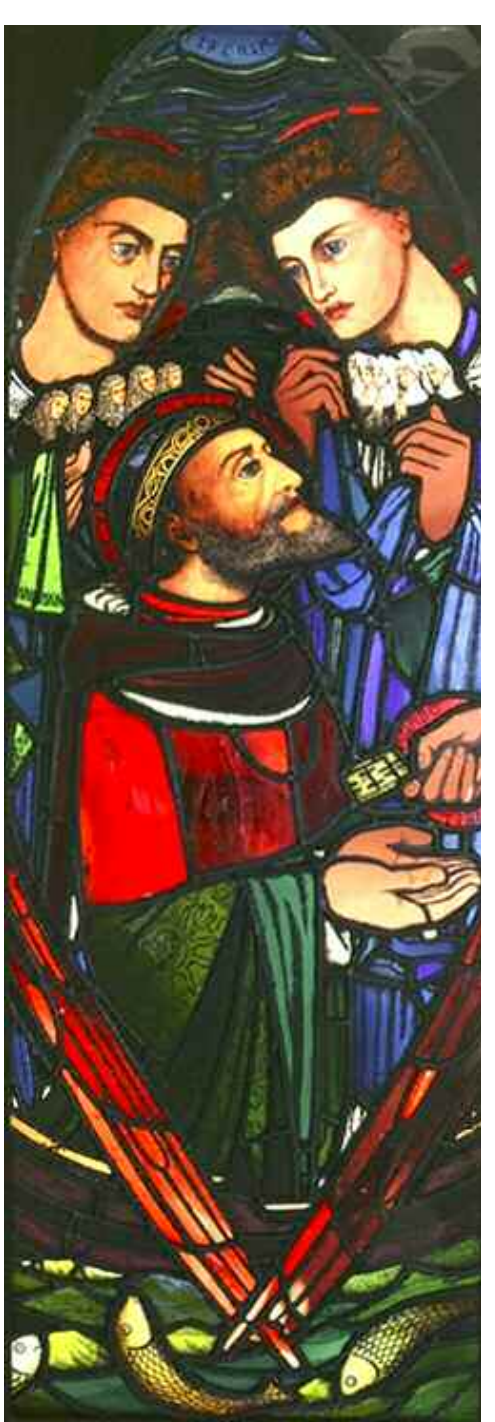
Stained glass, Edward Burne-Jones, Victoria and Albert Museum The Calling of Saint Peter

No amount of reading in books, of conversations or explanations,