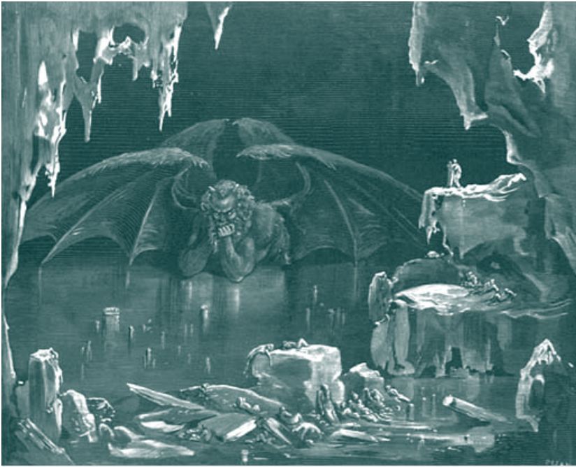
In the ninth circle of Dante's Inferno are beings covered with ice. In their midst broods Dis-Satan. Burning ice is a fitting symbol for loveless despair.

Star that led the Shepherds to the Christ Child.