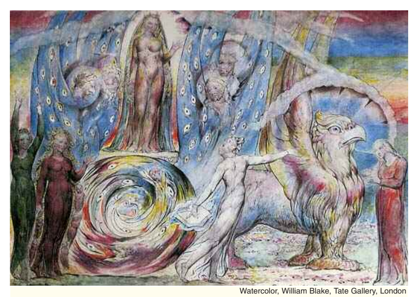
Beatrice and Dante The poet finds his Ideal (Beauty-Truth) girded by a ring of blue flames permeated with angelic eyes and four haloed heads of the zodiacal archetypes.

Golden Wedding Garment possesses five centers (eyes) which relate to one another as the points of a star. The desire body has seven main centers, situated deep within the aura. The mental sheath is still embryonic but centers are developing in the head area and above it, which sometimes resemble jewels set in a crown of iridescent or golden light, according to certain seers.