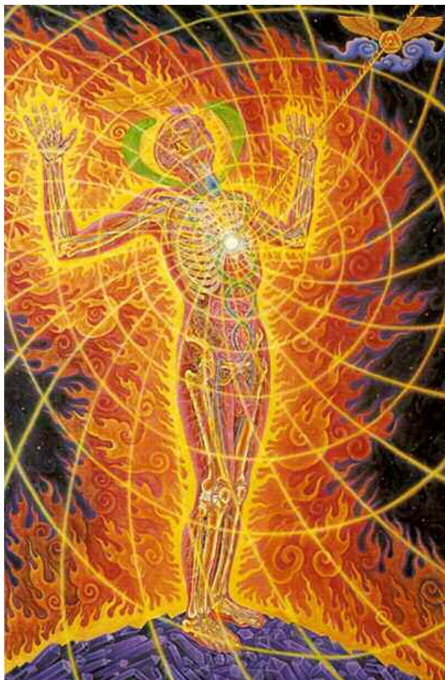
Oil on canvas, left panel of triptych, Alex Grey