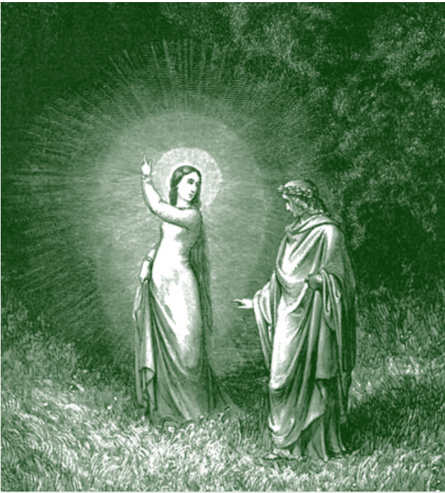
Engraving, from Illustrations for Dante's Inferno , Gustave Doré (1833-1883)

"Beatrice am I, who bid thee go."—Inferno, II, 70 So does the higher Self instruct the earthly ego to enter into the plutonian depths of its psyche and know itself—in full.