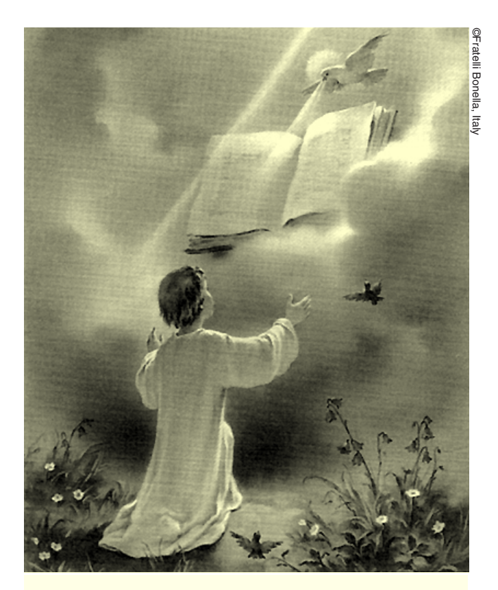
The Gift of Wisdom

When we enter the higher life, we must first forget everything that we knew in the world. We must commence to look at things in an entirely different way, and when a new teaching is brought before us we must endeavor to receive it regardless of other facts previously observed. This is in order that we