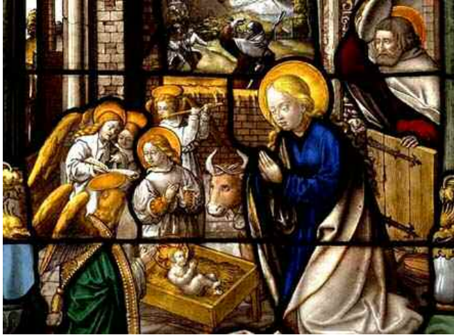
Stained glass (detail), ca. 1521. Master of St Severin, Lower Rhine, Germany Scenes from the Nativity

it varies from day to day and from month to month as sun and planets pass from sign to sign in their orbits. There are also yearly epochal variations due to precession of the equinoxes. Thus there is infinite variety in the song of the spheres, as indeed there must be, for this constant change of spiritual vibration is the basis of spiritual and physical evolution. Were it to cease even an instant, Cosmos would be resolved to Chaos.