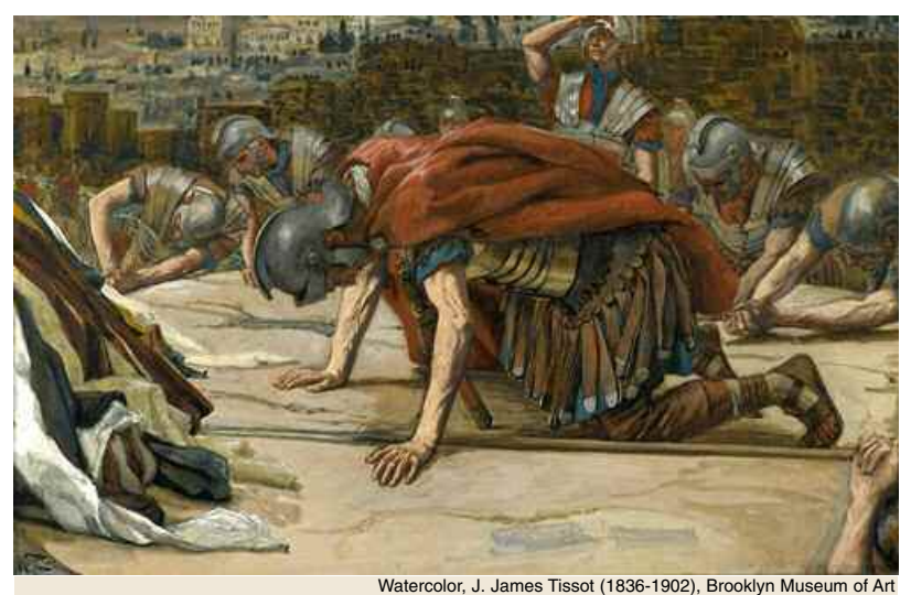
The Centurion glorifies Christ Who irradiates blinding light.

However, old conditions die hard. Under the