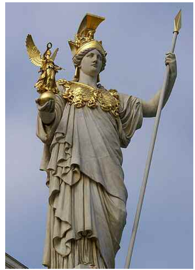
A neoclassical Pallas Athena in front of Parliament Building, Vienna, Austria The statue of Pallas Athene by the Greek sculptor Phidias shows the patron goddess of the Athenians in her more severe or Saturnian aspect. As daughter of Jupiter, the fruits of her wisdom flourished in a peace guarded by her firm vigilance.

As high rates of national unemployment in the