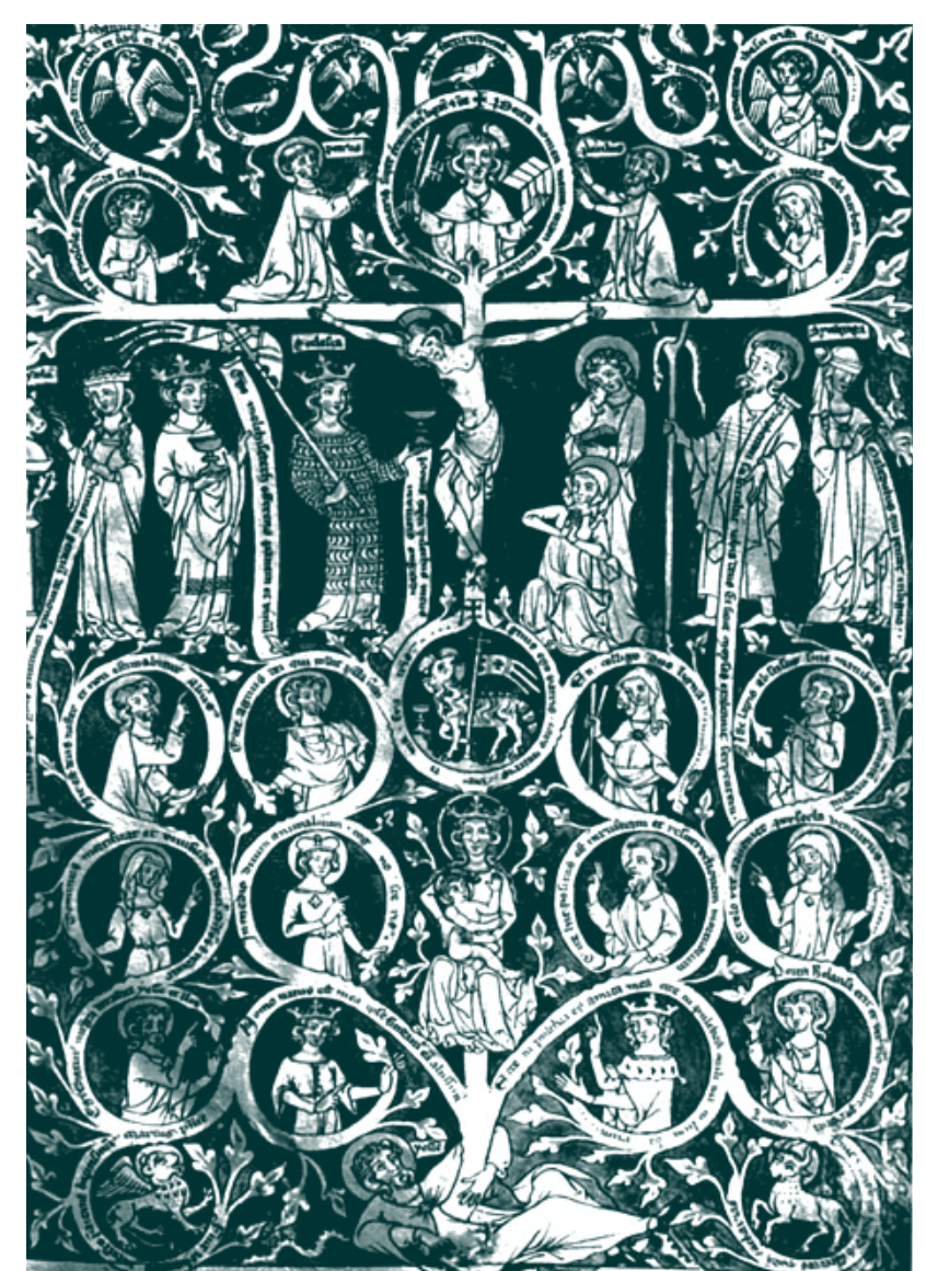
umination from Speculum humanae salvationis, c. 1340-50, Region of Lake Constance, Monastery Library, Kremsmünste *Tree of Jesse and Tree of the Cross**

The Philosopher's Stone is the tree of life. It can