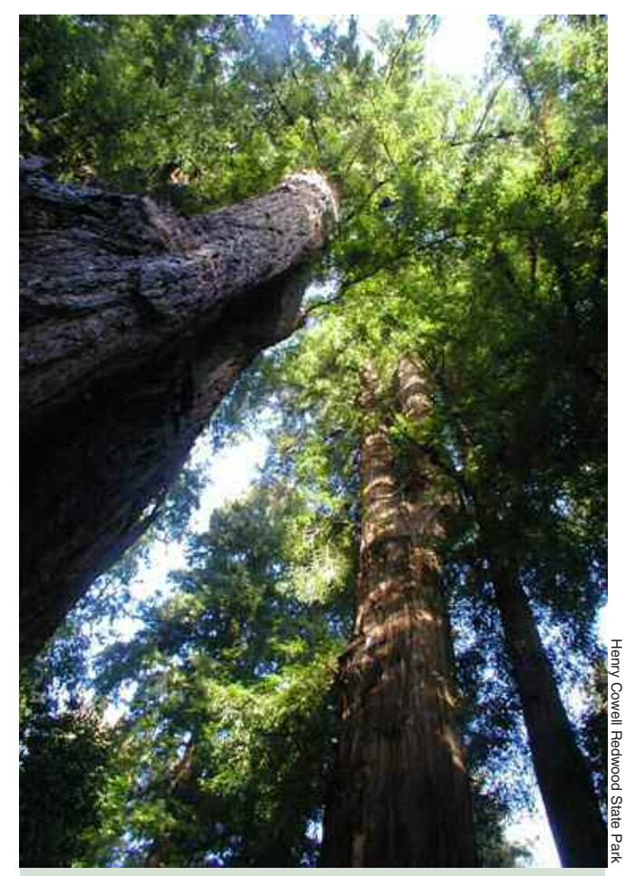
Towering California Redwoods

Trees teach us patience, sacrifice, aspiration, groundedness, jubilant anonymity, endurance of adversity, and unconditional generosity. In the world of nature, the tree most closely represents the human physical figure, not only in its vertical