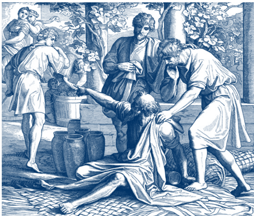
From Die Bibel in Bildern , Julius Schnorr von Carolsfeld (1789-1853)

The phenomenon of the rainbow requires that the Sun be near the horizon, the nearer the better; a clear atmosphere; and a dark rain cloud in the opposite quarter of the heavens. When under such conditions an observer stands with his back to the