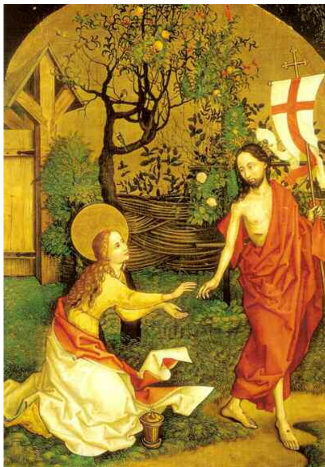
Martin Schongauer (1450-1491), Unterlinden Museum, Colmar, France

Therefore, if at present one does not find his prayers are being answered readily, it may be that he has never sat under the almond tree awaiting the vision and message of what his real work is to be, or he may have a warped conception of it. To such a one we would say, “Change your attitude for awhile.