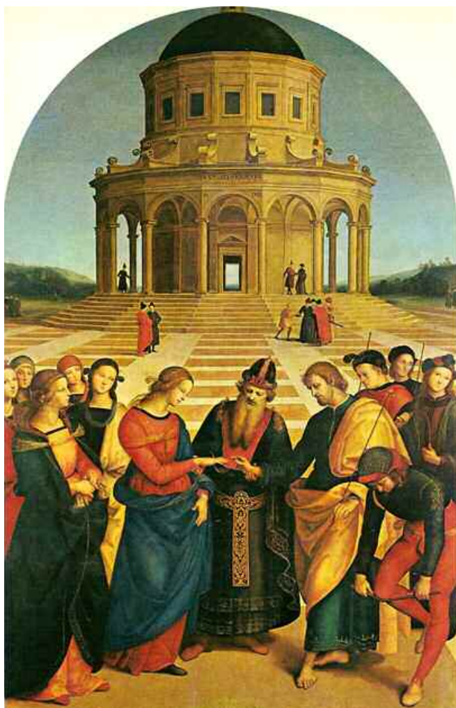
Raffaello Sanzio called Raphael (1483-1520), Brera, Milan

*See page 44 for picture of this painting