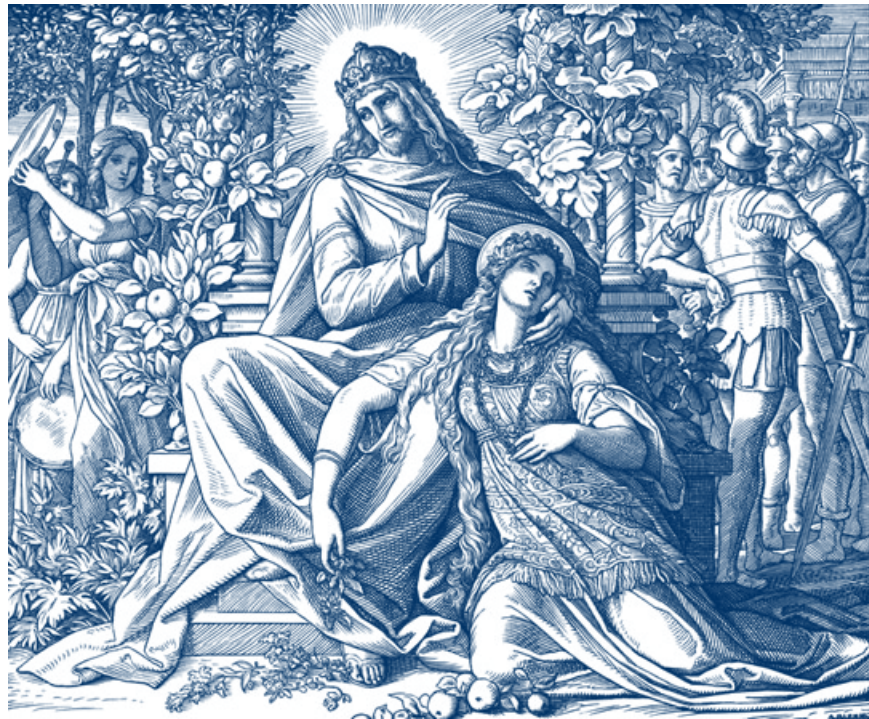
From Die Bibel in Bildern , Julius Schnorr von Carolsfeld (1789-1853)

Do you remember that when Jacob had deceived his father and had stolen his brother’s birthright, he found it expedient to leave home? One night he lay down, full of fear and distress at Bethel, a place formerly called Luz, which means an almond. If our symbolism is correct, he should have received a mes-