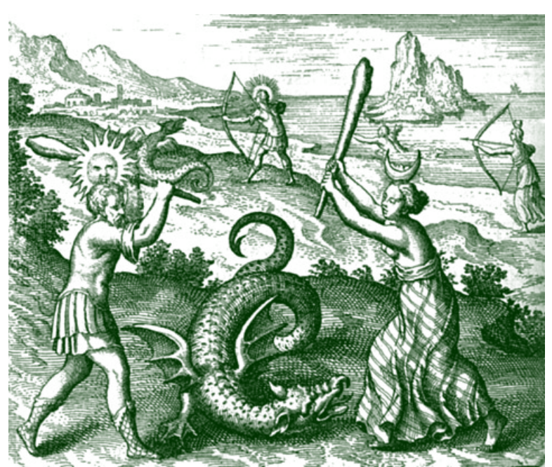
This alchemical illustration refers to the subjugation of the primitive life energies by the male and female components of the human Ego. The regenerative channeling of the creative life forces is represented as the "killing of the dragon." "The dragon only dies when he is killed by his brother and sister at once. Not by one alone, but by both at once, namely by sun and moon."—Rosarium philosophorum, Ed. J. Telle, Weinheim, 1992

The knees are ruled by Capricorn, the lower legs and ankles by Aquarius, these signs being respectively the night and day sign of Saturn, which rules the joints and the whole of the bony system. It is through his crystallizing influence that it is possible for man to have a skeleton and an upright position, which latter is necessary in order that the ego may become an indwelling intelligence and rule its