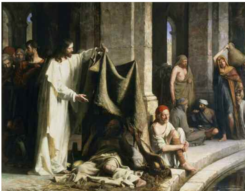
Oil on canvas, 292 x 355 cm, Carl Bloch (1834-1890), Bethesda Chapel, Copenhagen

The Third Rose designates the power of teach-