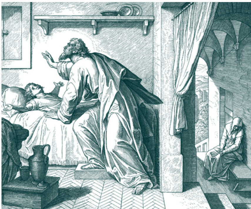
From Die Bibel in Bildern , Julius Schnorr von Carolstfeld (1789-1853)

The Fifth Rose symbolizes the power to cast out devils. "These things that I do, ye shall do, aye, and greater." This power of the Divine Mind, the Christ Mind, includes the ability to free us from all forms of obsession in enmity with God and man. Residences for the psychically disturbed are