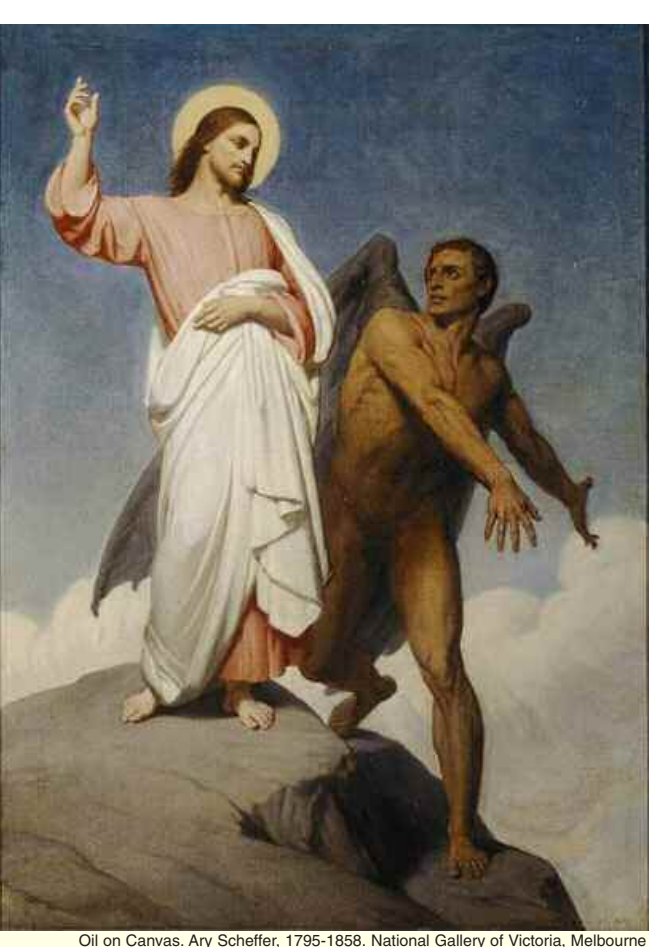
The Temptation of Christ The third of three temptations is here illustrated: to surren der one's soul for dominion over all the world. The artist has depicted a Devil whose outward appearance does not miti gate against what he believes to be an attractive proposal.

The planet and spirit Saturn is the Satan of the Bible. He is called "Old Father Time" because his mission is limited to time, the period of human unfoldment. He is called "the God of this world,"