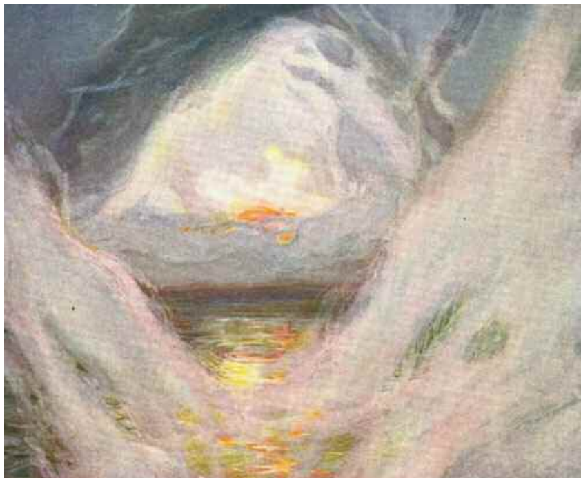
Opaque watercolor over graphite on gray wove paper. J. James Tissot, 1836-1902.

The occultist readily agrees that a Solar System may be formed in approximately the manner illustrated. But he marvels greatly that a man possessing the clear intuition enabling him to perceive with such accuracy the operation of Cosmic processes, and the intellect to conceive this brilliant demonstration of his monumental theory, should at the same time be quite unable to see that in his demonstration he himself plays the part of God . He was the extraneous power that placed the oil in the water, where it would have remained inert and shapeless through all eternity had he not