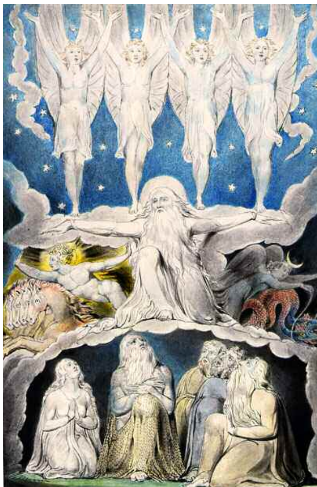
Watercolor, 1805-06, Butts Set, William Blake, Pierpont Morgan Library, New York

In addition to the creative Hierarchies which worked voluntarily in our evolution, there are seven others which belong to our evolution, and are co-workers with God in the formation of the universe. In the first chapter of Genesis these Hierarchies are called Elohim . The name signifies a host of dual or double-sexed Beings. The first part of the word is Eloh , which is a feminine noun, the letter h indicating the gender. If a single feminine Being were meant, the word Eloh would have been used. The feminine plural is oth , so if the intention had been to indicate a number of Gods of