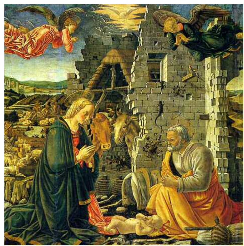
Master of the Louvre Nativity, active second half of the fifteenth century, Louvre, Paris The Nativity

Adventus and Natale are both synonyms for the Incarnation as well as for the feast which commemorates and celebrates the Incarnation. Like-