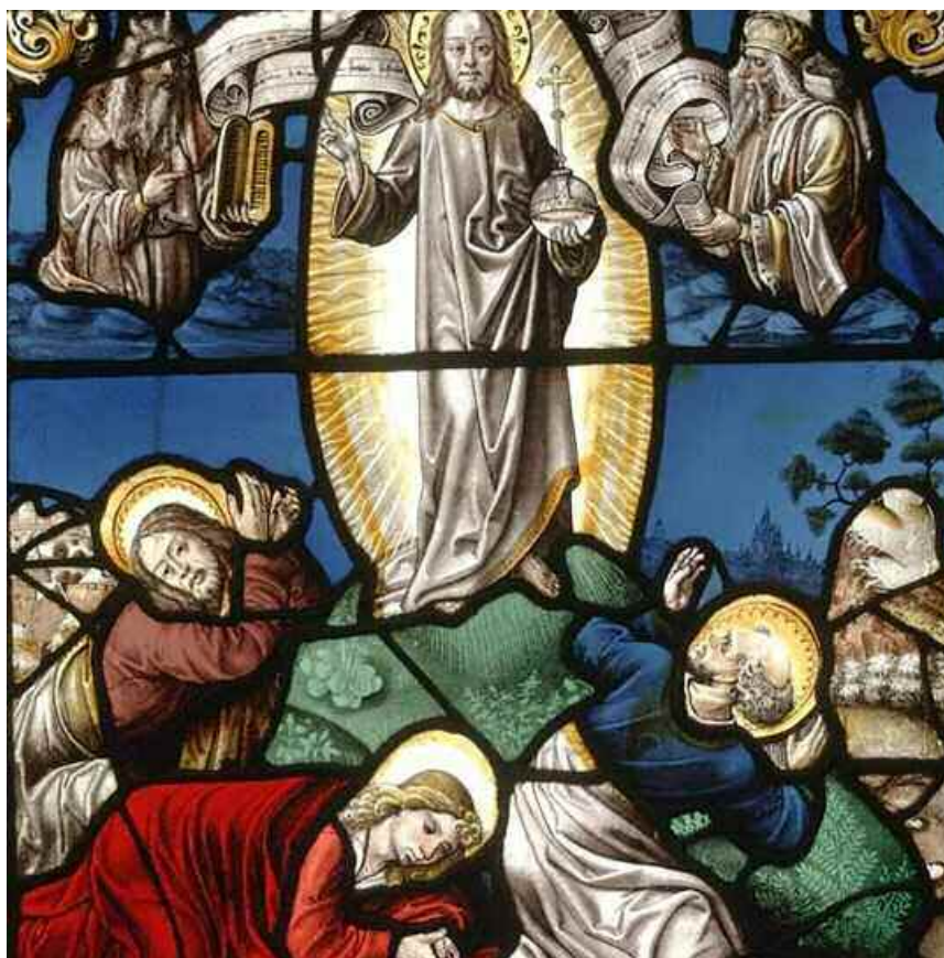
Stained glass, Master of St Severin (c. 1485-1515/German). Victoria and Albert Museum, London, England

(2) Christ Jesus asks His disciples who people say He is (Matt. 16). Strange question, is it not? Jesus is Jesus. His disciples answer that some say He is John the Baptist (now beheaded), some Jeremiah, some Elias, or some other prophet. What is necessarily implied in both question and responses? That Jesus pre-existed in a prior physical embodiment. Nor does He correct them by saying, "You know better than to believe in rebirth," as any teacher concerned with imparting truth would do.