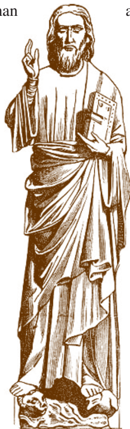
The Christ of the Cathedral of Amiens

These are surely acceptable criteria by which one may judge the relevance and value of what one is invited to investigate. The Wisdom Teachings of Rosicrucian Christianity are, in some respects, the antithesis of Christian orthodoxies. They do not enforce belief. They do not use the ploys and threats of institutional authority to exact compliance to codes