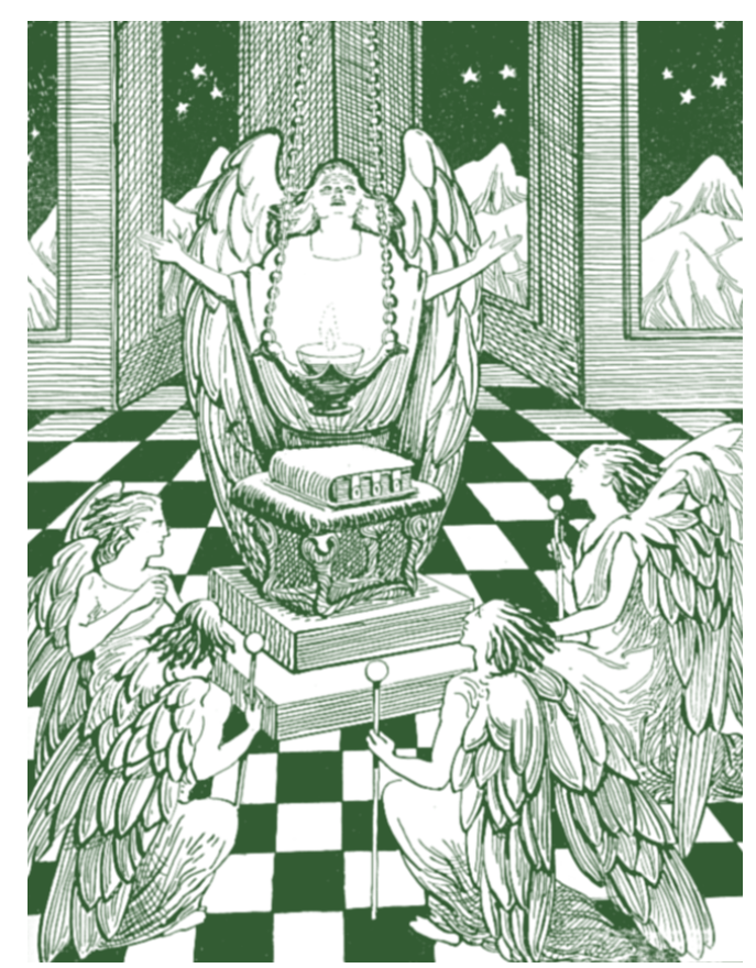
Mars petitions while four green angels reverently regard the magic lamp that will grant any wish and the book with seven locks which contains all the knowledge of the world.

and creeping inside they stepped on to a kind of lift—anyway it seemed like a lift for it was a little room with seats on one side. And after they sat down the whole place went suddenly dark and—swish—bump—their breath was nearly taken away, and then they saw a faint light.