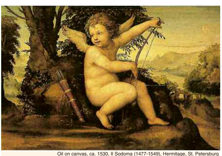
Cupid in a Landscape

Pure love is divine, spiritual, and dissociated from personality, and is yet beyond men. Therefore,