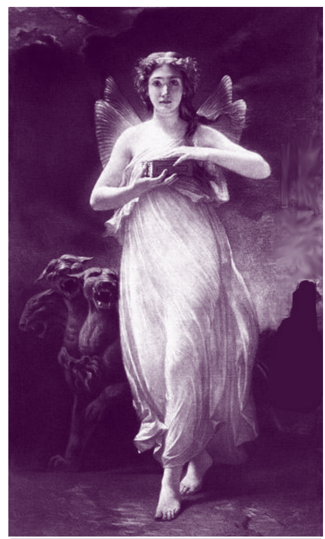
Psyche in the Underworld One task assigned Psyche was to retrieve without opening a box of Beauty from Proserpina in Hades, Overcome by curiosity, she opened the box and released a Stygian sleep.

Then came the era of the steam engine, the day of machinery when man became only a cog in the production mechanism, when he could scarcely hope to become master but must drudge his life