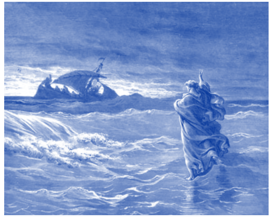
Illustration for the Bible, 1866. Gustave Doré