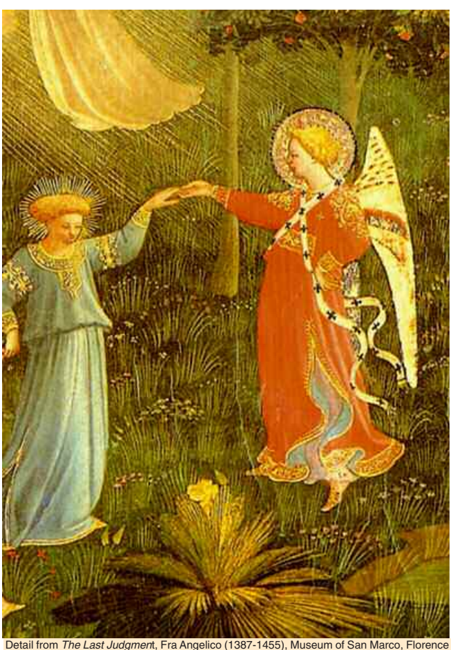
Angel Conducting a Soul to Heaven

Prior to birth, when the Recording Angels are building the archetype for a person's life, they plan various learning and serving opportunities for that individual. If, during life, that person neglects to take advantage of the learning and serving opportunities given and turns onto a path which is of little value to his or other people's soul growth, the