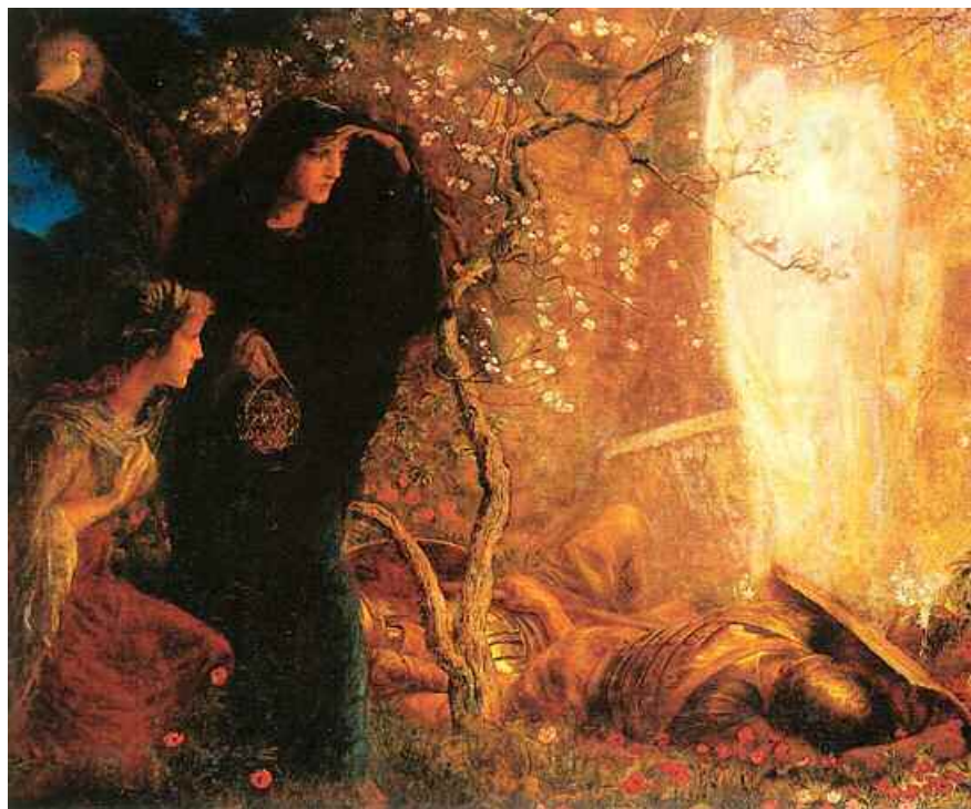
Oil on Canvas, 1893-96. Arthur Hughes. William Morris Gallery, Walthamstow, England

It was therefore necessary to leave it frequently for a period of complete rest so that the