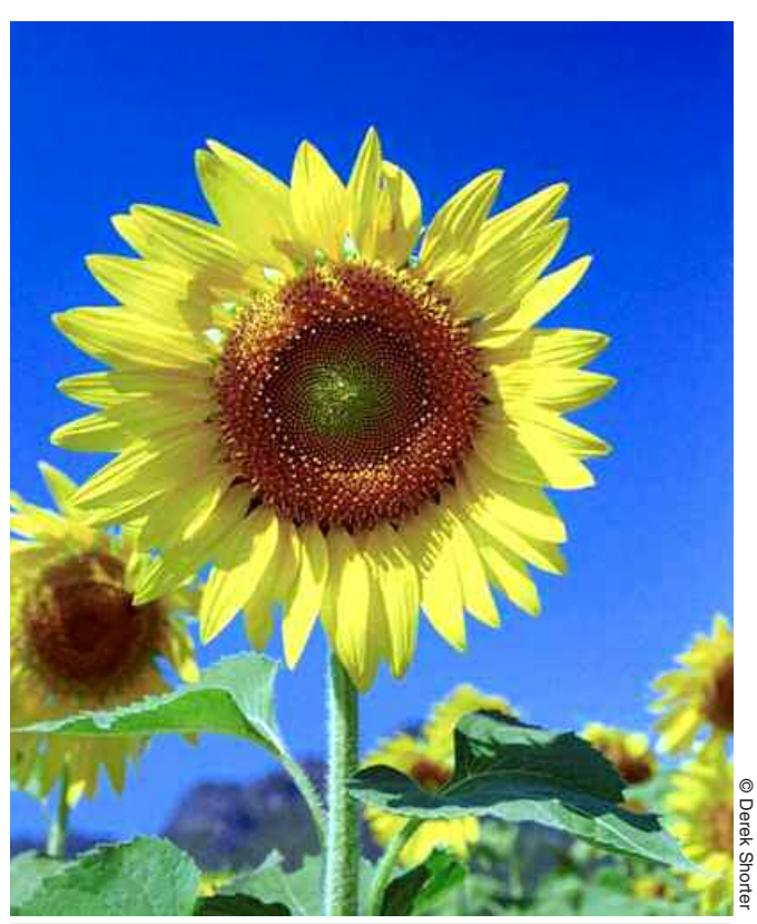
Sunflower seeds may be sprouted for nutritional salads, crushed to obtain cooking oil and livestock and poultry feed, and used as bird seed. A sunflower head may measure more than 17 inches across.

Research shows that sprouts are one of the foods